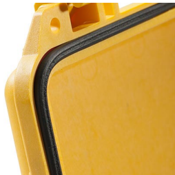
1753 Replacement O-ring